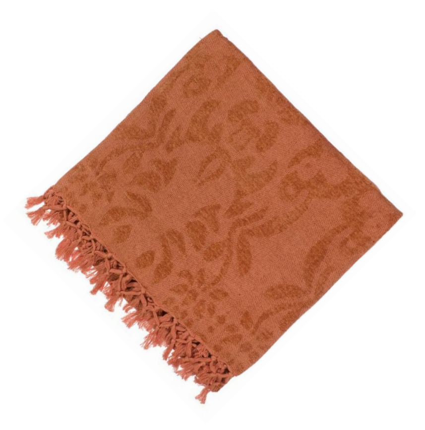
Shown here... Surya throw, framed art, and a pouf. Previous page , Surya rug and pillow.